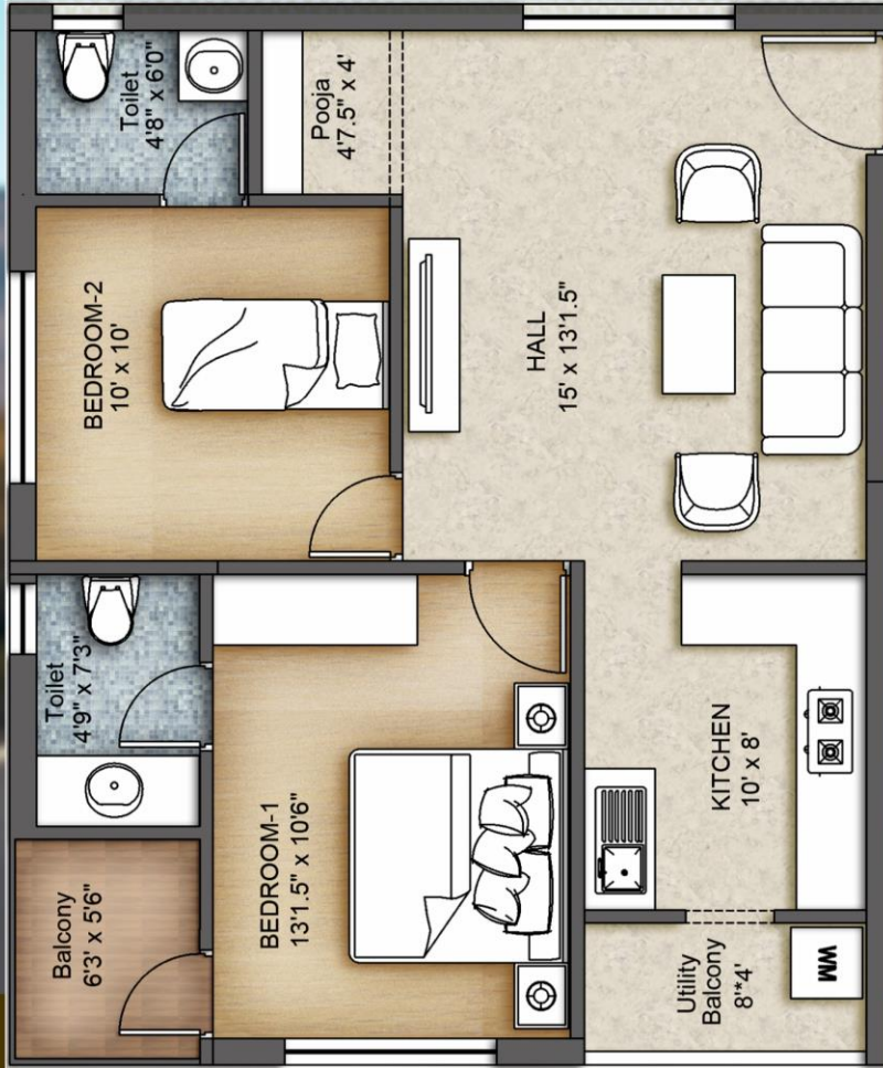
2BHK East Facing