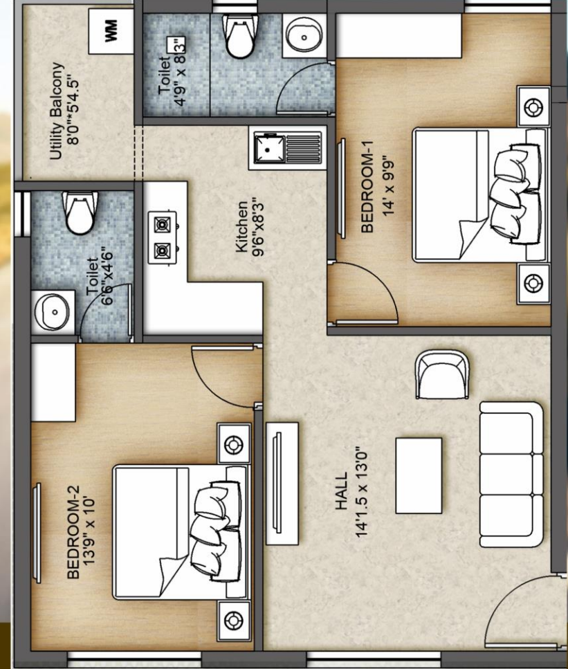
2 BHK West / North Facing